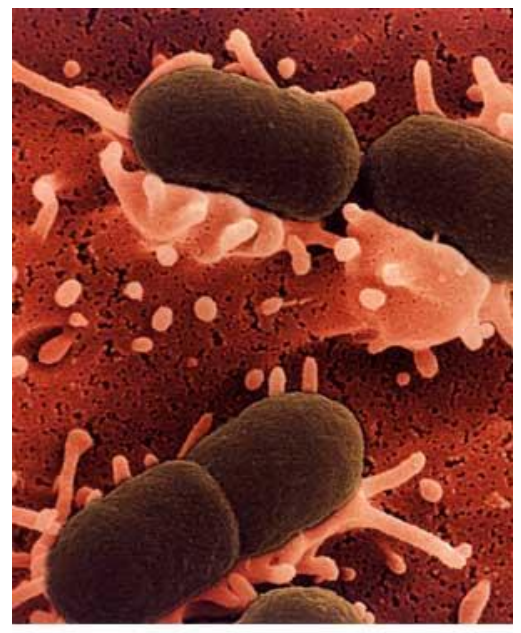
Fig. 2. Escherichia coli adhering to human intestinal cells.

Ordinarily, the urinary system is hostile territory for bacteria, viruses, or any other microorganisms. Bugs that do make their way into a healthy urinary tract are likely to find an inhospitable acidic environment (pH <5.5). They are also subject to attack by the body's immune defenses. (Adult men have the added protection of a specific bacterial growth inhibitor squirted directly into the urinary system by their prostate gland.) Even if microorganisms manage to over- come these